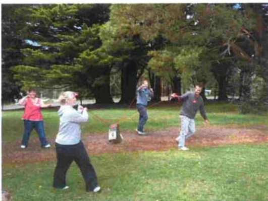
Outdoor activities—RYLA Camp 2008

Whether you are a university student, young professional or a tradesperson, RYLA provides a memorable opportunity to learn, grow, have fun and make new friends. Those who complete the RYLA program are generally better able to successfully manage their own lives, careers and make a mark on society.