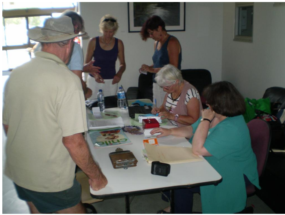
The Marketers - Hard at Work!!!