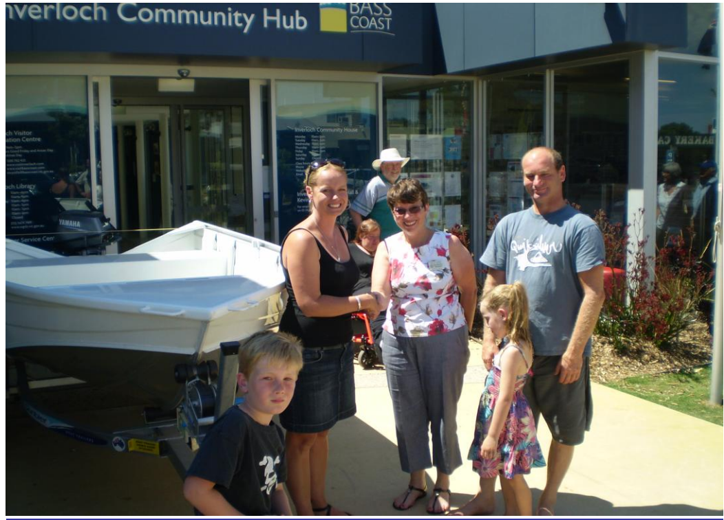
Family Fun in store – The Raffle Winners